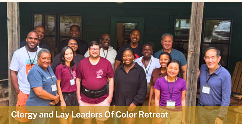
Clergy and Lay Leaders Of Color Retreat