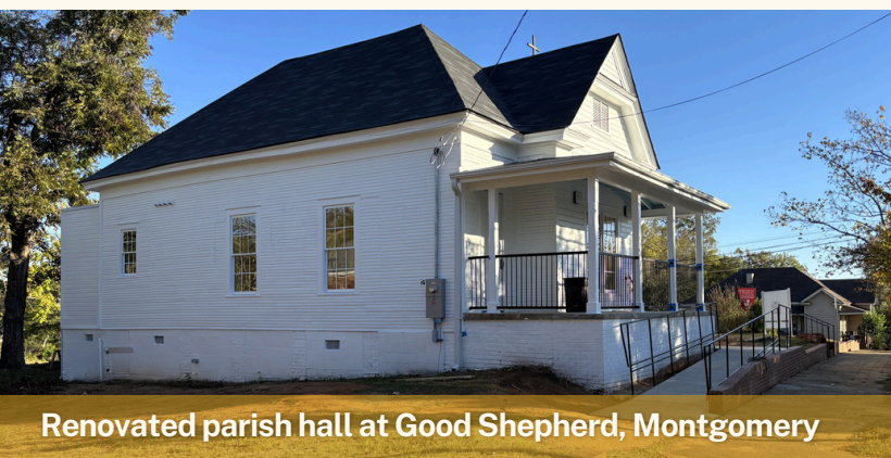
Renovated parish hall at Good Shepherd, Montgomery