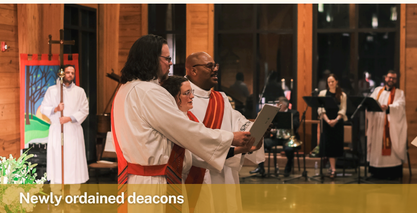
Newly ordained deacons