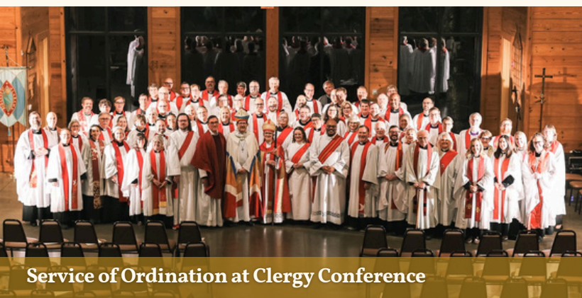
Service of Ordination at Clergy Conference