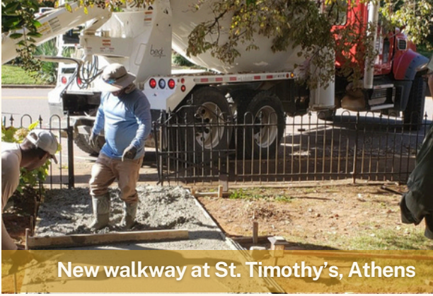
New walkway at St. Timothy’s, Athens