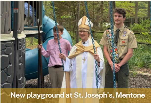
New playground at St. Joseph’s, Mentone