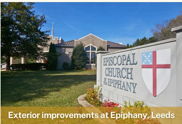
Exterior improvements at Epiphany, Leeds