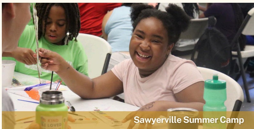
Sawyerville Summer Camp