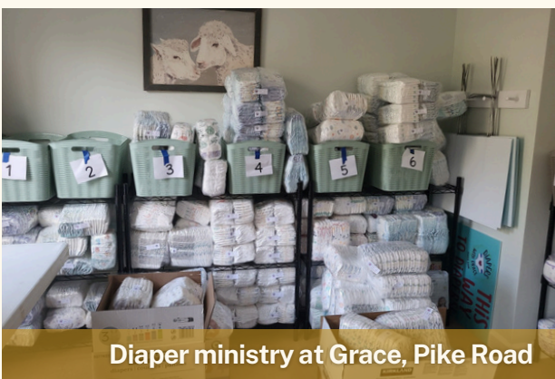
Diaper ministry at Grace, Pike Road