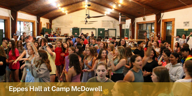
Eppes Hall at Camp McDowell