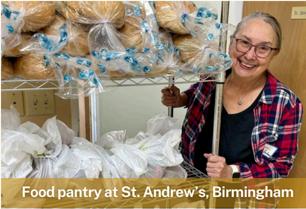
Food pantry at St. Andrew’s, Birmingham