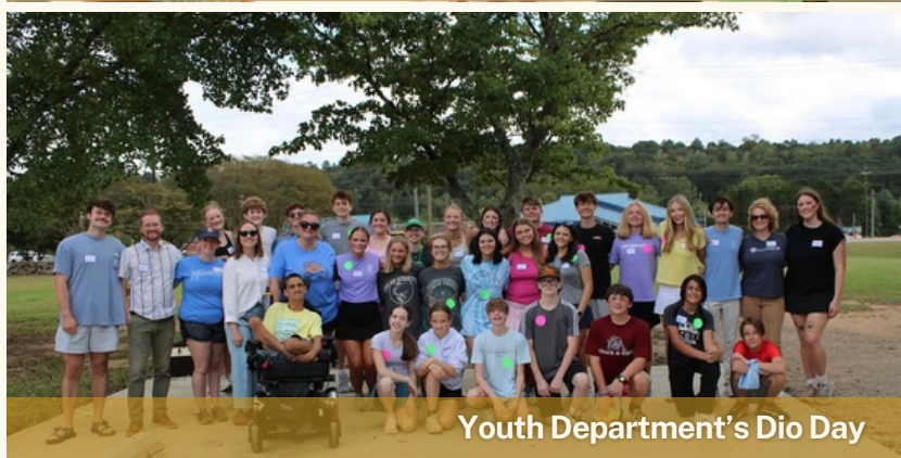
Youth Department's Dio Day